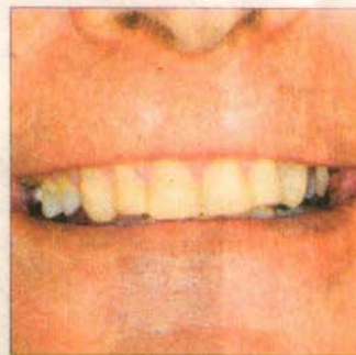
■ Before and after: Tooth erosion caused by gastric reflux can now be rebuilt

rexia, bulimia or who grind their teeth in their sleep.